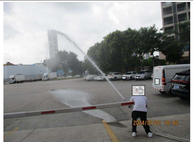
Fire hydrant test