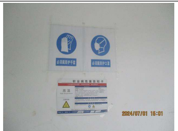
PPE warning sign