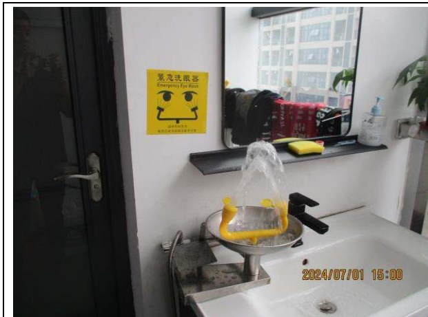
Eye washing facility