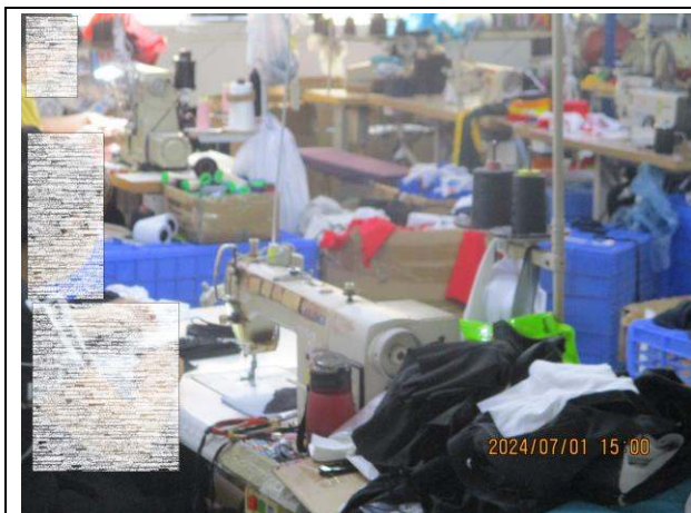
NC: No finger protection ring for sewing machine