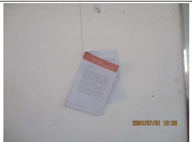
amfori BSCI Code Onsite