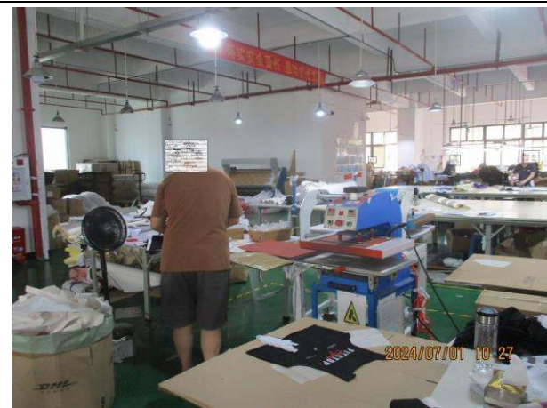
Heat transfer printing