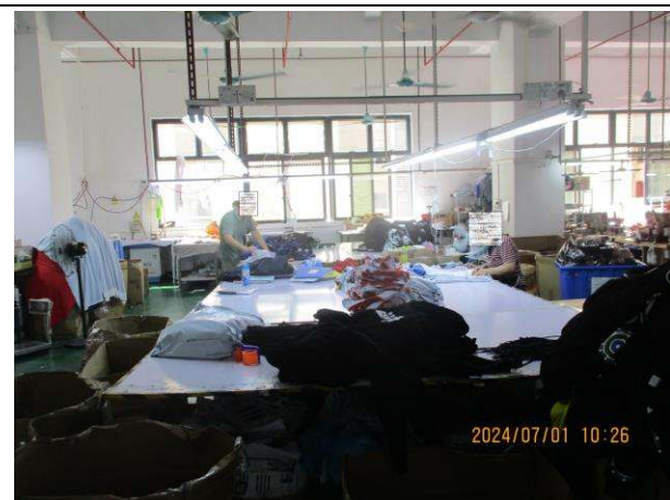
Trimming and Ironing