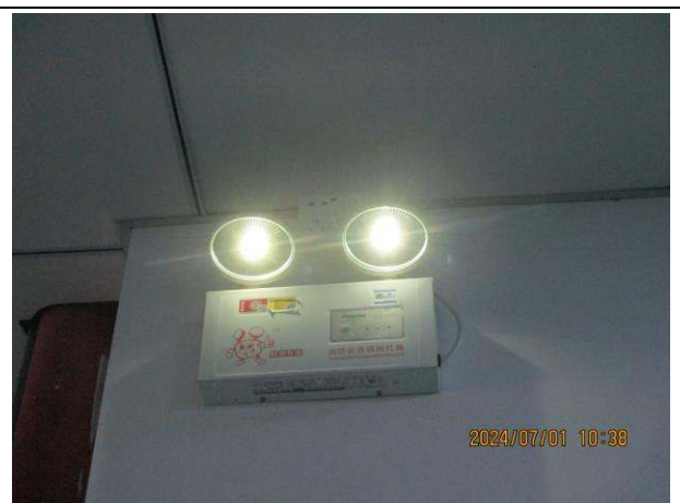
Emergency lighting test