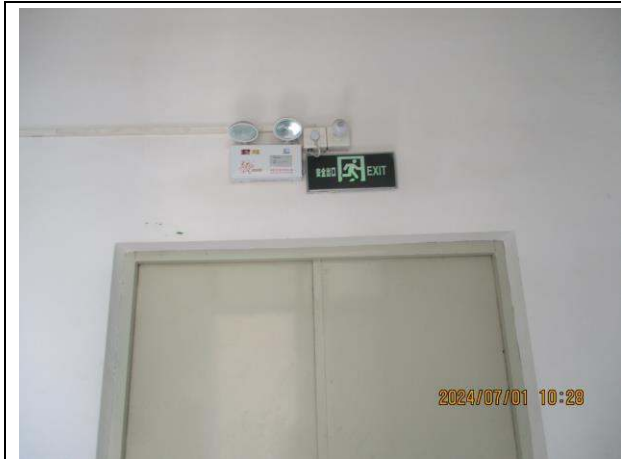
Exit sign and emergency light