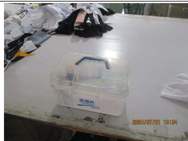
First aid kit