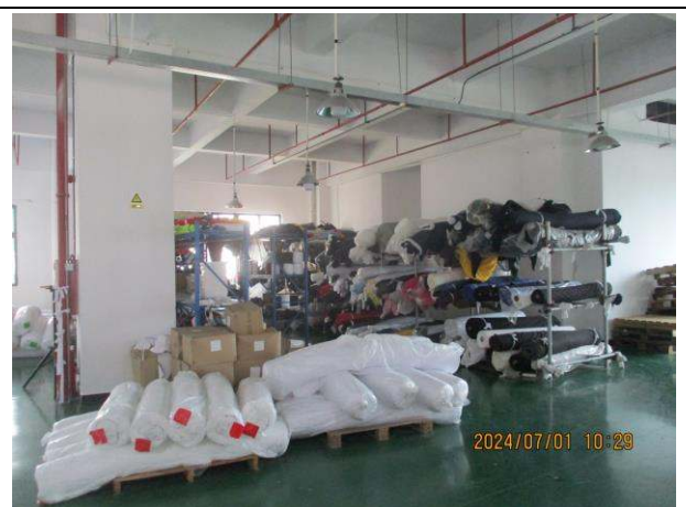
Raw materials area