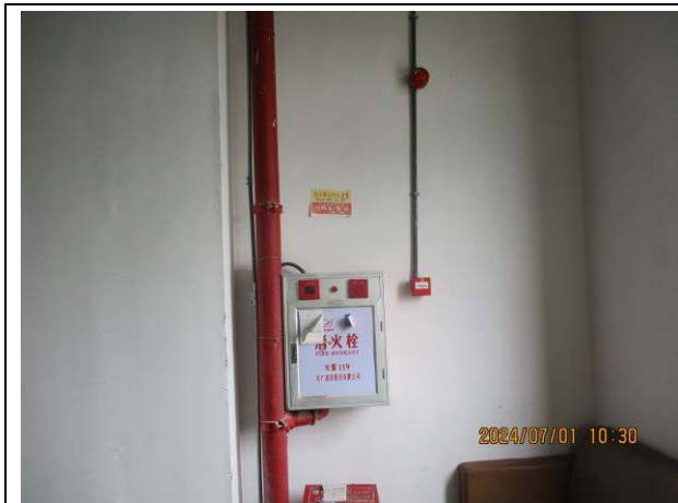
Fire hydrant and alarm