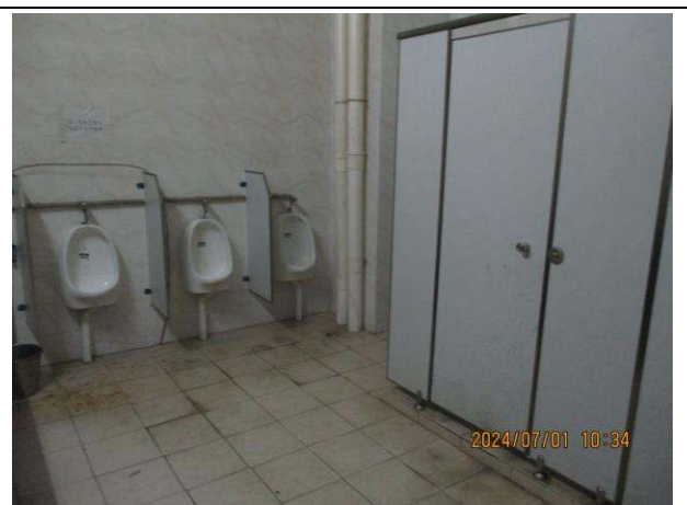
NC: No soap/ liquid soap and tissue in toilet