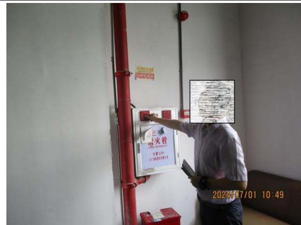
Fire alarm test