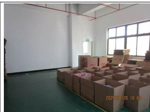
Finished products warehouse