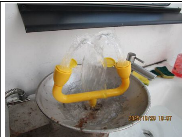
Eye washing facility