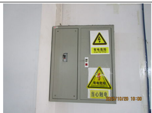
Electrical box with warning sign