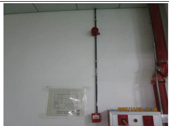
Fire alarm test