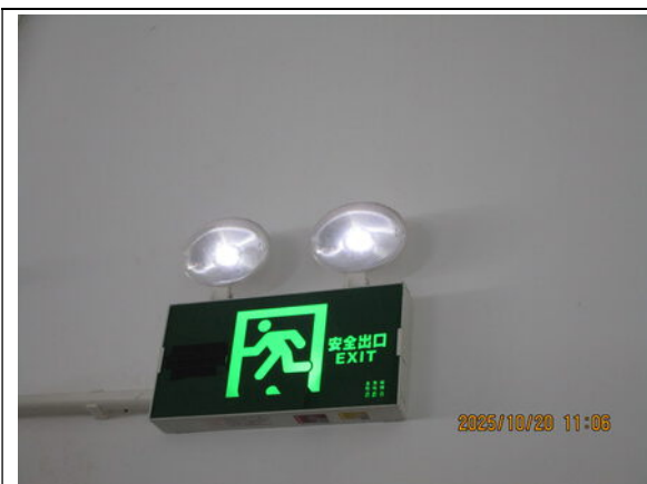
Emergency light test