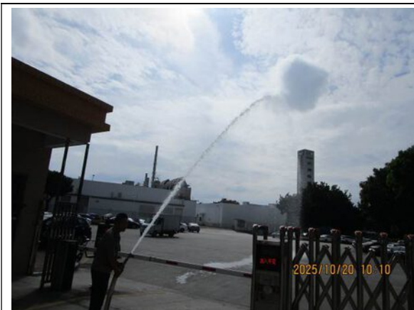
Fire hydrant test