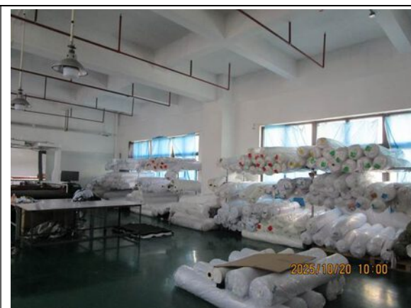
Raw material warehouse