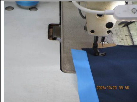
NC: Sewing machines were not installed with finger protection device