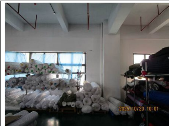
NC: 10% of the raw materials and finished products in warehouse of factory were placed against the wall.