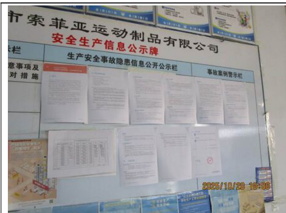
amfori BSCI code