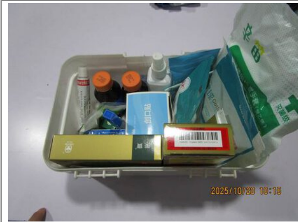
First aid kits