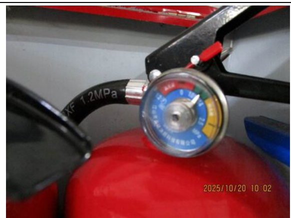
Fire extinguisher in good condition