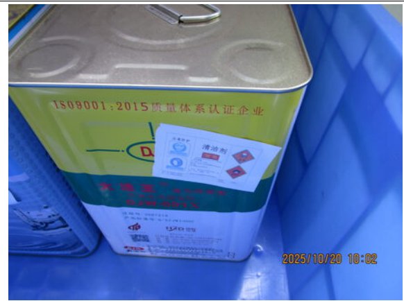
Chemical safety label