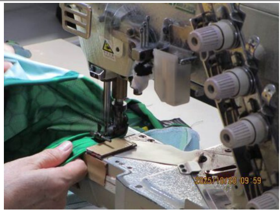
NC: One high sewing machine was not installed with needle protection device.