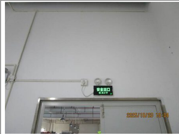
Exit sign and emergency light