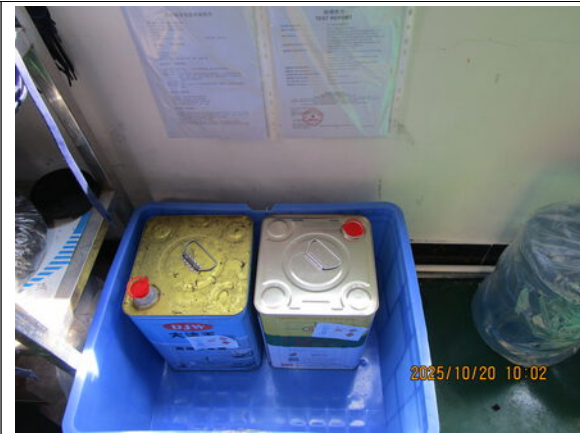
Chemical with secondary containment