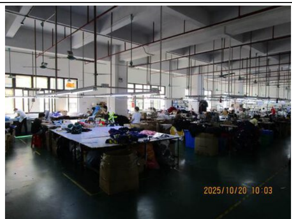
Trimming and packing